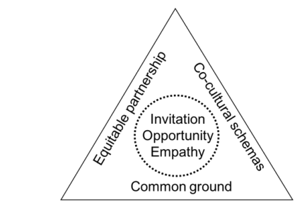
Figure 1. Cultural mediation for equitable interactions.

In addition, robot mediation aims to help children achieve three communicative goals (building common ground, building an equitable partnership, and building a co-cultural schema), which offer optimal conditions for equitable, inter-cultural communication. The first step for enabling children to work together is building common ground. Children need to feel comfortable with each other and share their personal stories in order to establish a minimum level of common experience and trust. Equitable partnerships emphasize that another's autonomy and identity are as important as one's own. This respect is developed through careful listening, openness to new experience, and collaborative interactions. Cultural schemas are built up through repetitive experiences in cultural situations. While they engage in interactive, imaginative activities in the robot-mediated learning community, children co-construct meaning, understanding, and identity in the unique activities they share. Figure 1 presents the robot mediation model geared toward achieving these communicative goals.